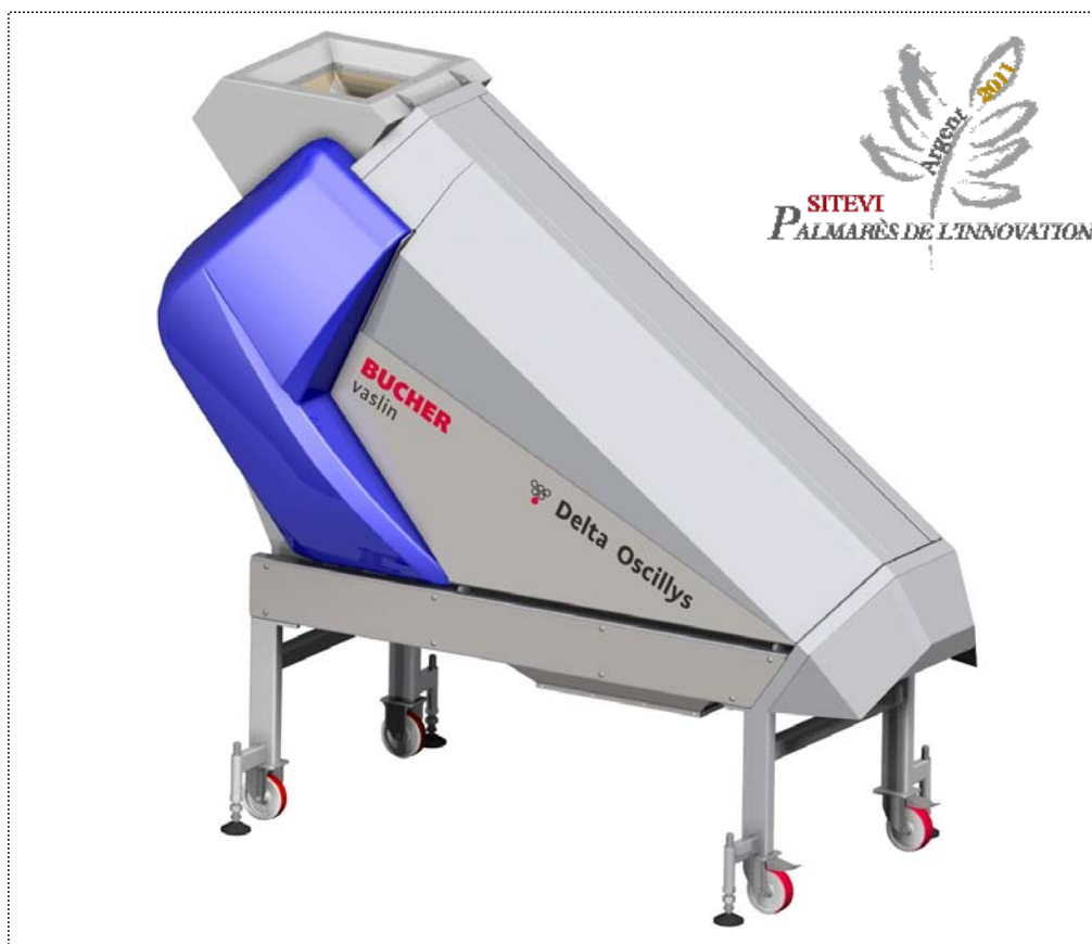
Delta Oscillys 100