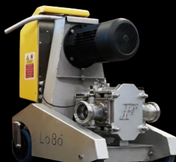
LoBó over 3 bars