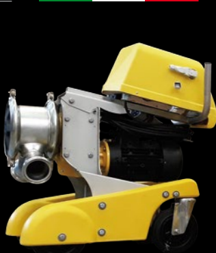
CATERINA for transferts